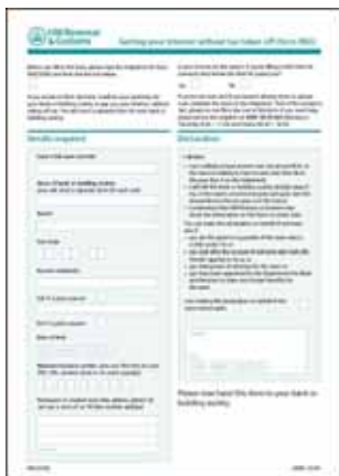
R85 allows interest to be paid gross

Of course, those not liable to tax can use form R85 to apply for gross payment of interest, but where money is invested by a parent on behalf of their child, it is actually treated as the parent's income for tax purposes as soon as the income exceeds £100 a year. For those with an eye to the longer term—particularly university education costs—having savings taxed is simply slowing the rate at which much-needed capital will grow.