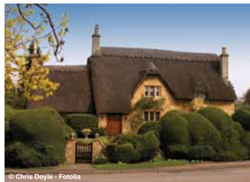
A strong housing market underpins confidence

Rising house prices are something of a mixed blessing. On the one hand, they lead to consumer confidence; on the other, they are potentially inflationary, by leading to demand for higher wages to cover bigger mortgages. From the viewpoint of young