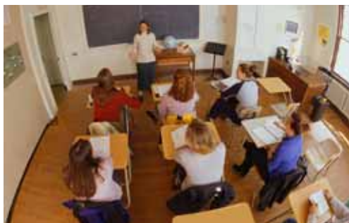
Students have enough to worry about without financial cares as well

If for example, £50,000 is invested by a grandparent in an offshore bond